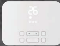
Concealed Display Screen and Touch Control Button