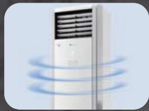
Beautiful Integrated Design