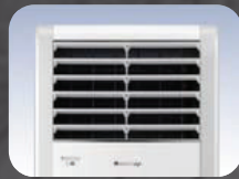
Precise Air Guiding